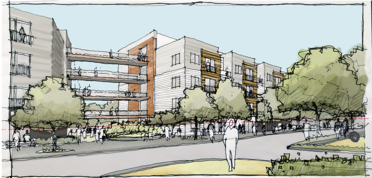
Figure 3. View of the front side of the South Wing.