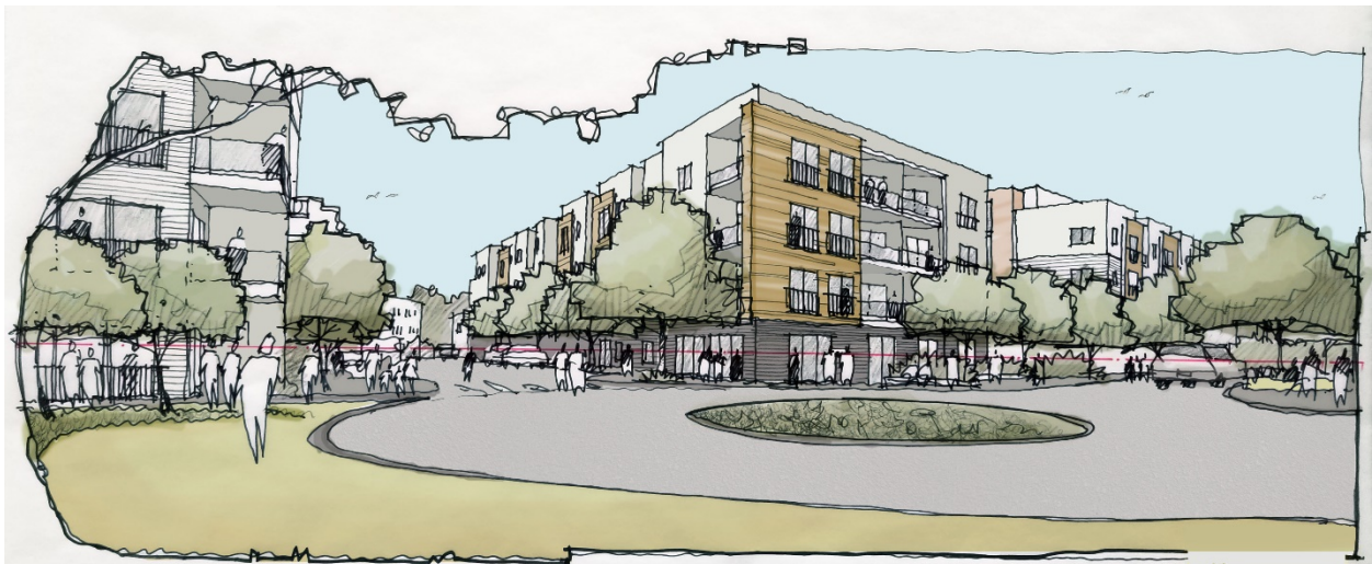
Figure 2. View of the North Wing (center) and South Wing (at right), separated from Building 2 (at left) by a shaded, pedestrian-friendly vehicular travelway. Note that the 5 th floor of the North Wing is not visible from this vantage point due to the proposed stepback on the 5 th floor.