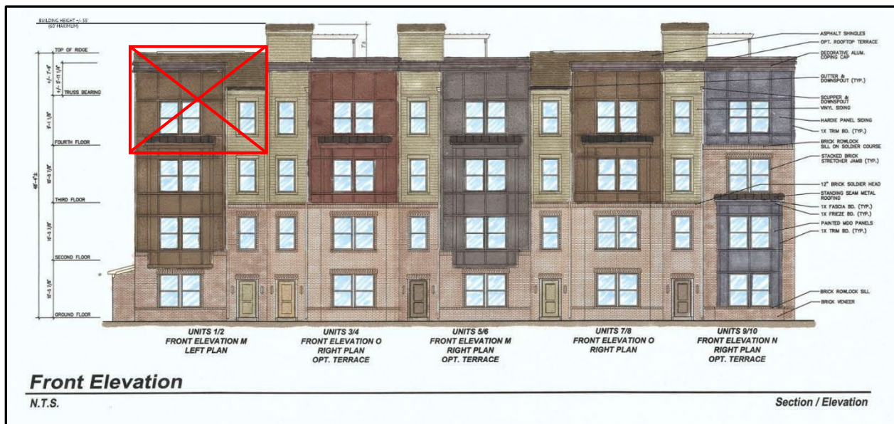
Figure 4. Illustrative Example showing the front elevation of a row of the Townhomes. The red box indicates the portion of the fourth floor to be removed, creating a single 3-story unit on the end of each row of the Townhomes.