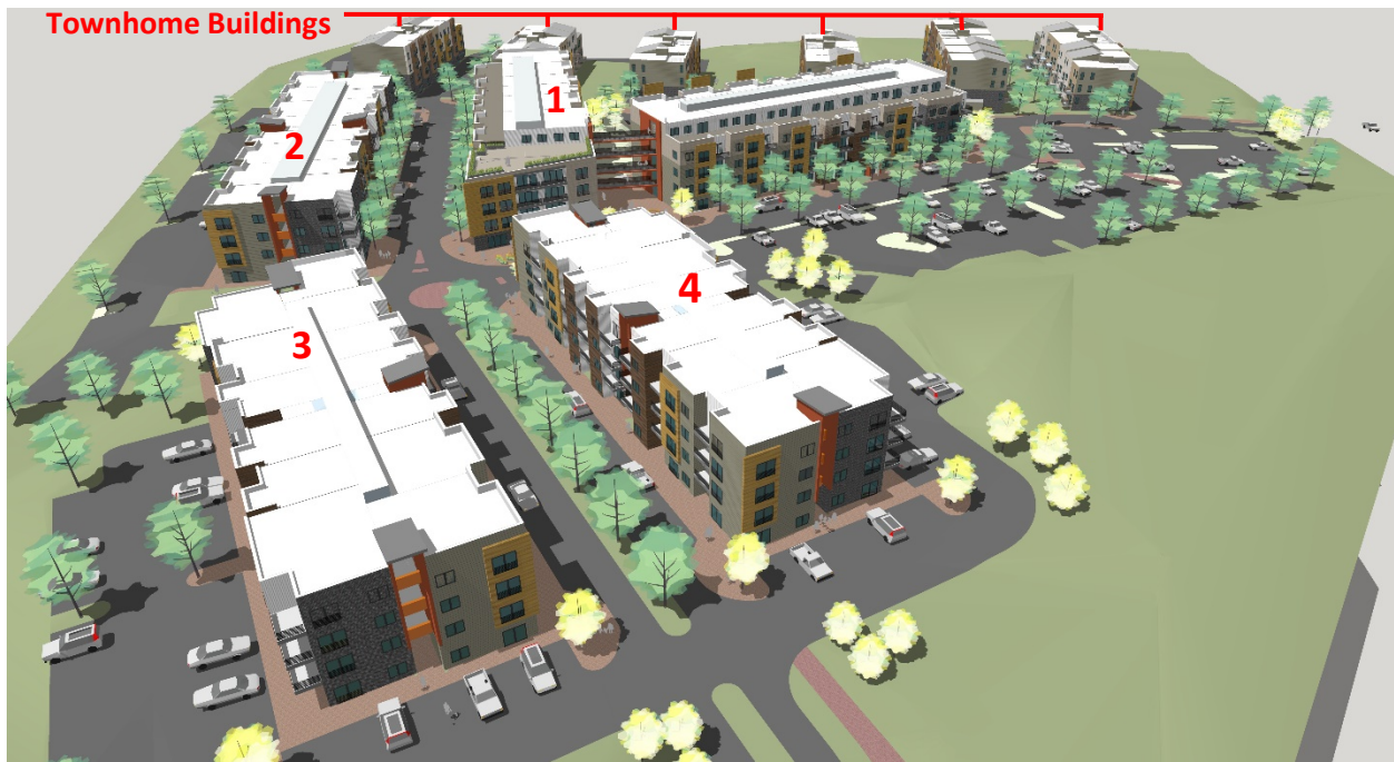
Figure 1. View of the Project, including Building 1 at center (the South Wing is at right).