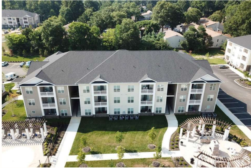
The above photo is of the Village of Westlake, the Breeden-developed community in Richmond, VA which serves as the prototype for Berkmar Apartments