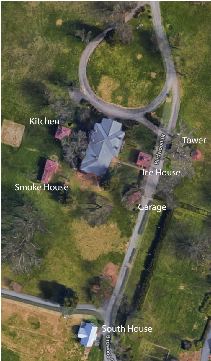
Current site layout

This plan is for illustrative purposes only and is subject to change.