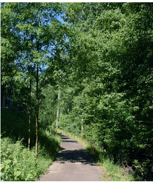
TYPE A Multi-Use Path