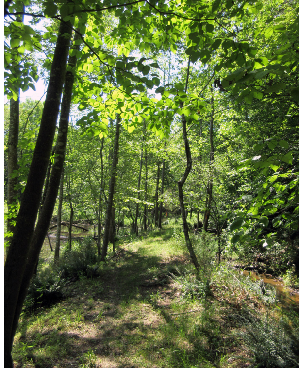
TYPE B Primitive Nature Trail