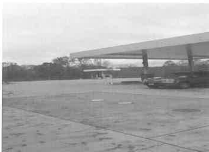
Looking SW across gasoline basin towards fence at back of property.