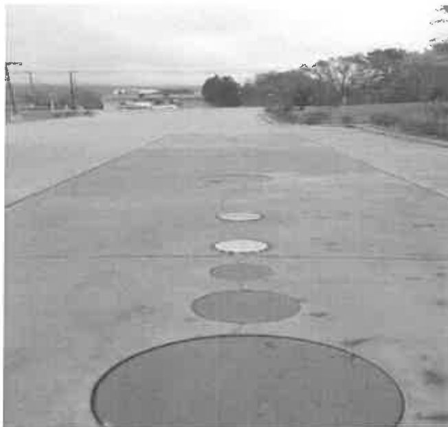
Looking North at the gasoline basin