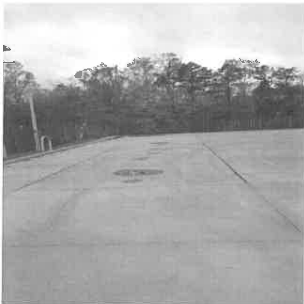
Looking west at the Diesel Tank basin

On 11/08/2017 I visited the above site as a follow up to a complaint about gasoline odors. I visited the site in the afternoon and found no odor of gasoline present except at the dispensers actively dispensing fuel to vehicles. All the equipment I observed appeared to be properly functioning. I took the following photographs on 2/8/17: