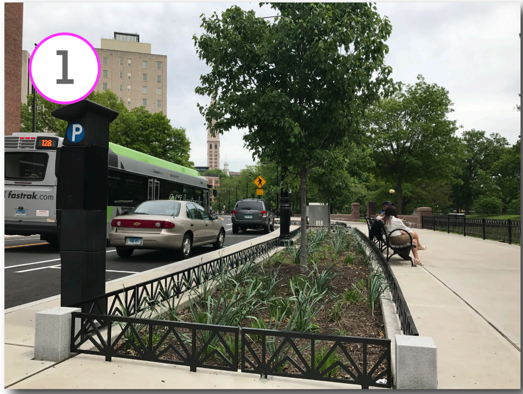
major connector with green infrastructure