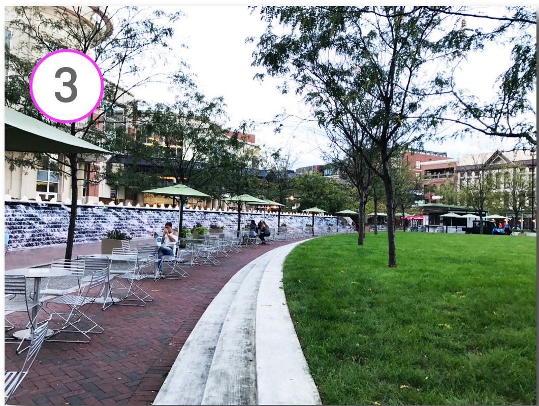
civic green space