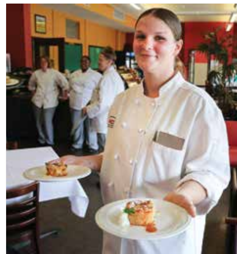
Most graduates of PVCC's Career and Technical Education programs are employed within six months of earning their credential.