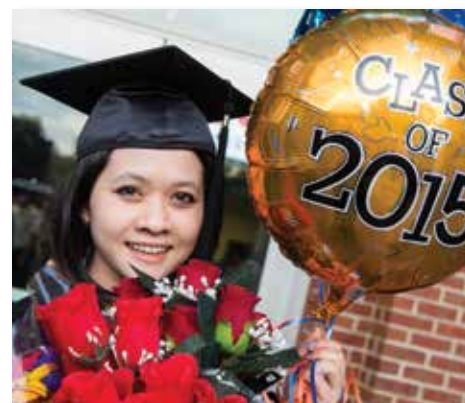
PVCC awarded 892 degrees and certificates to students graduating during the 2014-15 academic year.