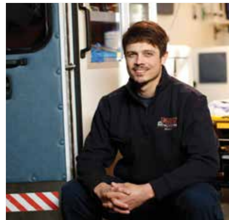
Increasing numbers of graduates in PVCC healthcare programs provide Central Virginia's employers with an expanding pool of trained workers.