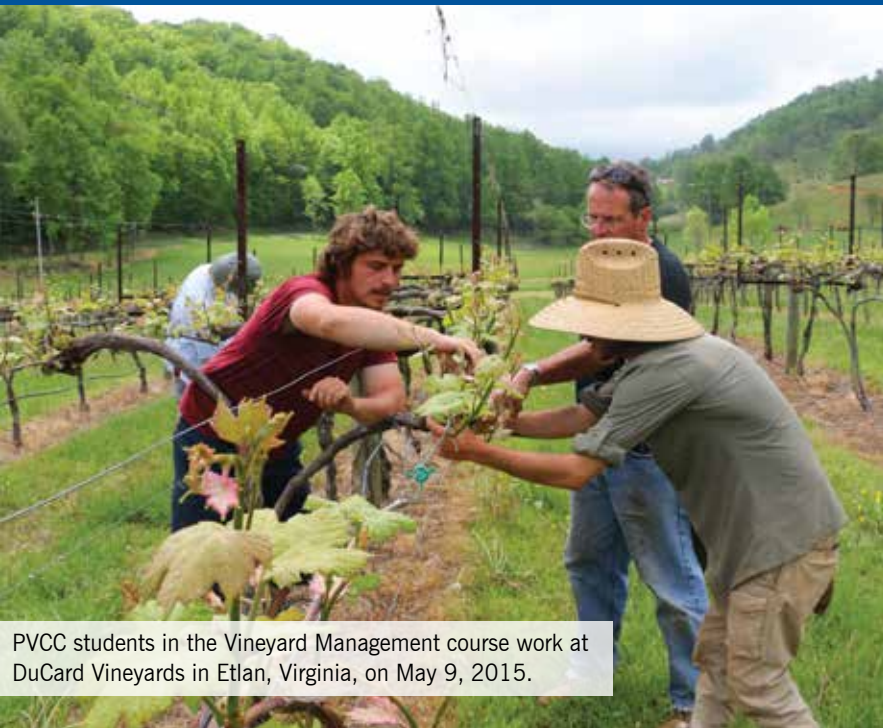
PVCC students in the Vineyard Management course work at DuCard Vineyards in Etlan, Virginia, on May 9, 2015.