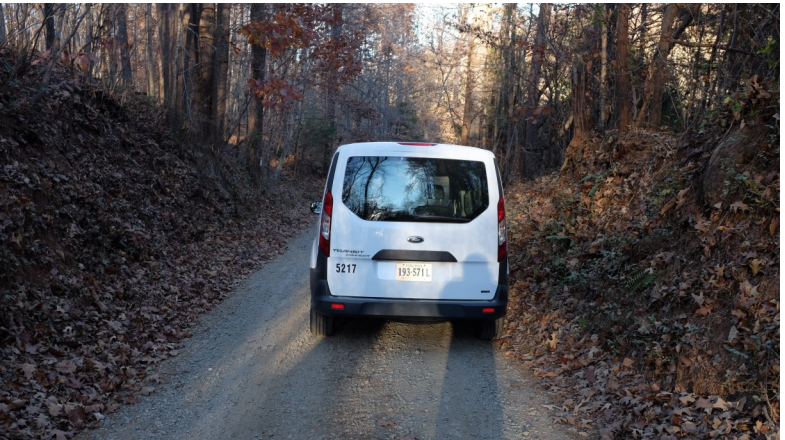
Road Width: 11 feet