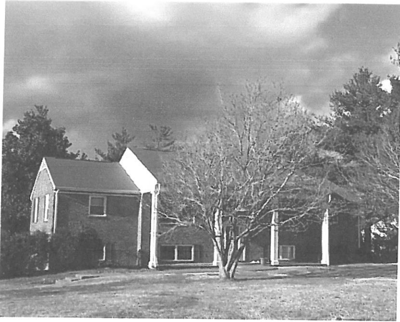
2405 Northfields Before Purchased by Darrick Harris.