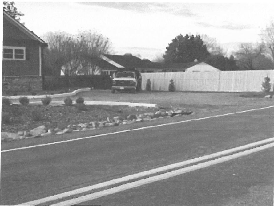
The right side of the house with a large gravel area. You can also see the close proximity to the neighboring home.