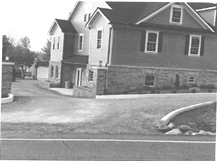
The left side of the house and the Driveway with Gravel all the way around.