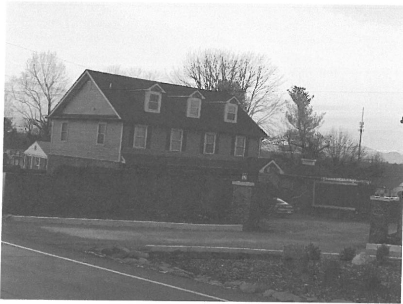
Three-car Garage with Large Living Space Upstairs. You can also see the neighboring house directly behind the garage which towers over it.