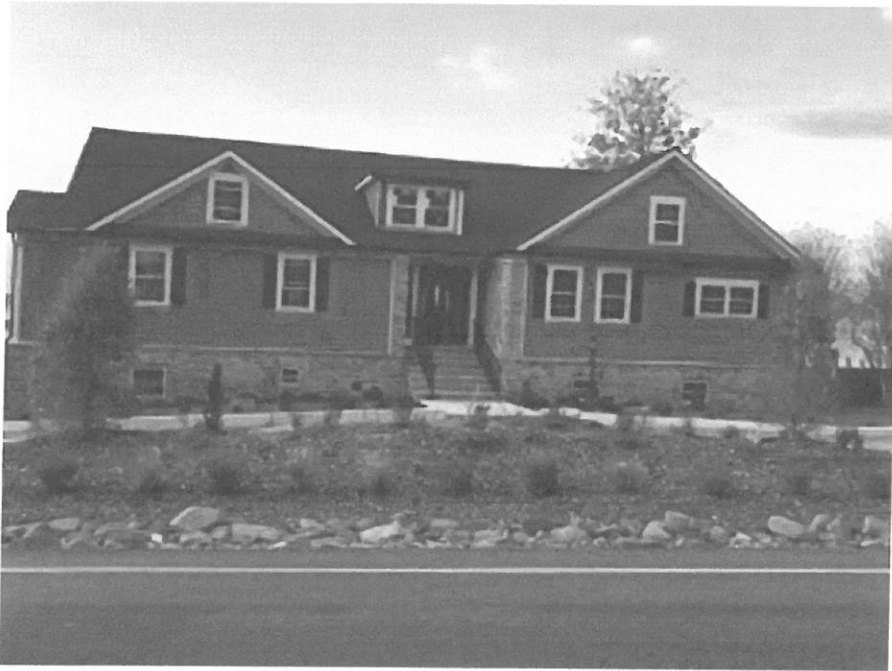
The front of the house with a gravel circle and a small strip of plants. No longer a split foyer and no resemblance to the previous house for a building permit which was for an addition to the front and back of the house. Also no mention of the garage.