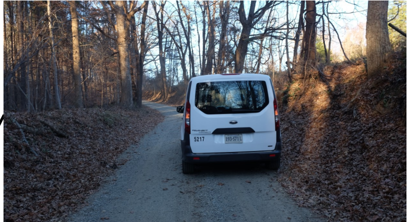
Road Width: 11 feet