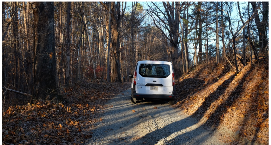
Road Width: 10 feet