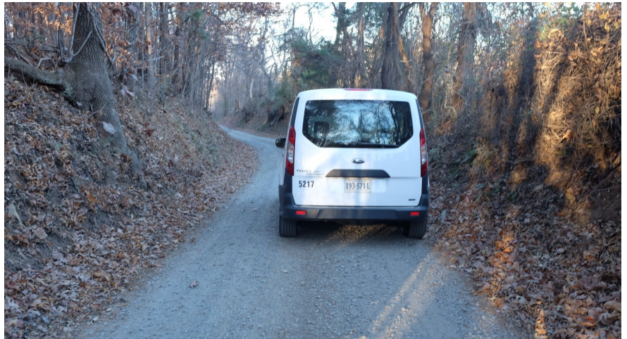
Road Width: 11 feet