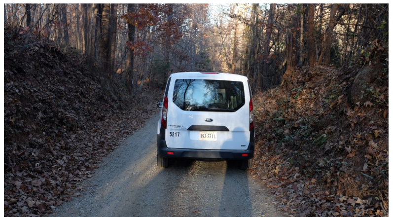
Road Width: 11 feet