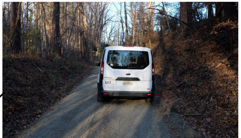
Road Width: 12 feet