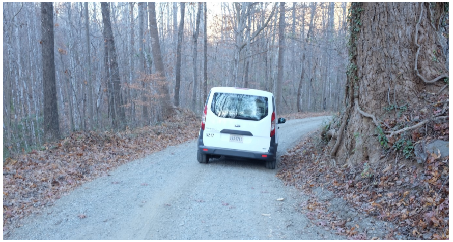
Road Width: 12 feet