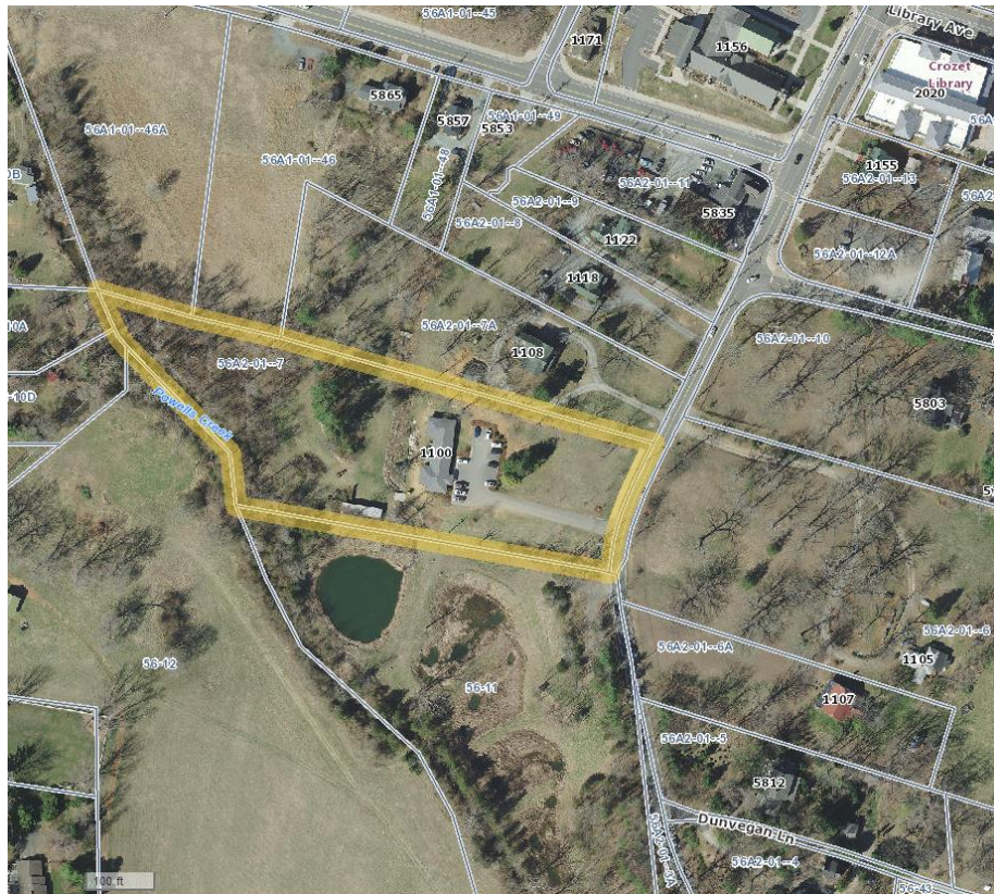
Animal Wellness Center – 1100 Crozet Avenue

Animal Wellness Center, Inc. (“AWC” or the “Applicant”) is a veterinary clinic located in Downtown Crozet, operating at 1100 Crozet Avenue, on Tax Map Parcel 056A2-01-00-00700 (the “Property”). The Property is further described by the figure and table below.