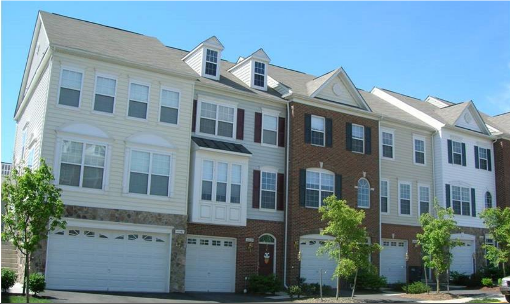
Staggering, varied building materials, and architectural elements such as dormers and bay windows contribute to creating no readily identifiable pattern of market rate and ADU units.