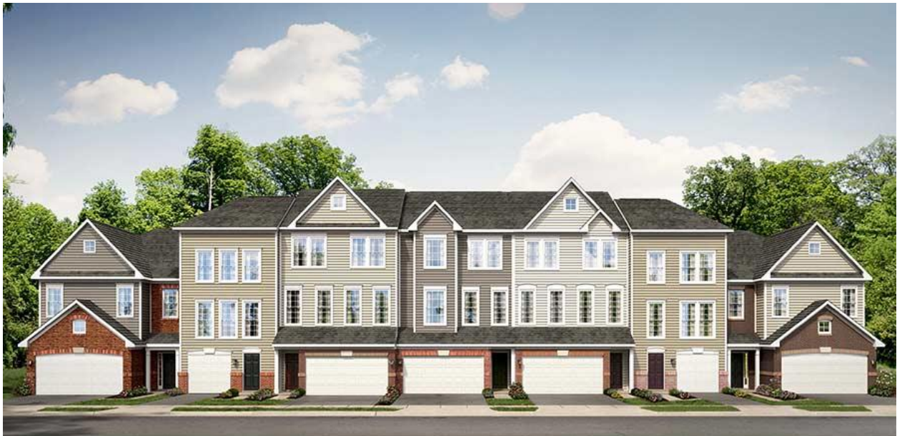
EXAMPLE OF OFFSETS BLENDING UNIT WIDTHS

Smaller ADU units are mixed with two story units, a varying roof line, and wider units. Building materials and colors also vary to contribute to an inconspicuous blending of ADUs with market rate units.