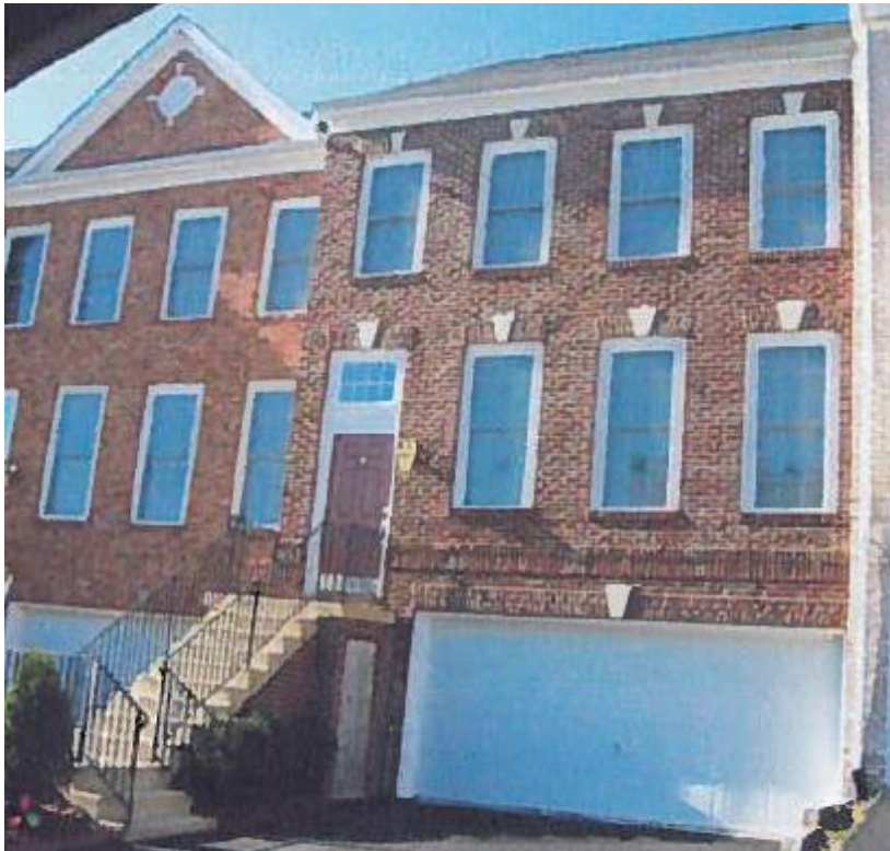
ADUs using the same building materials and colors as adjacent market rate units are generally indistinguishable.