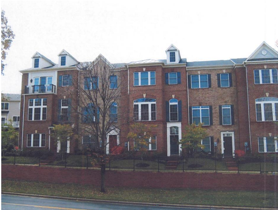
Despite being narrower, ADU units blend with adjacent units due to varying brick color, roof lines, and staggering of units.