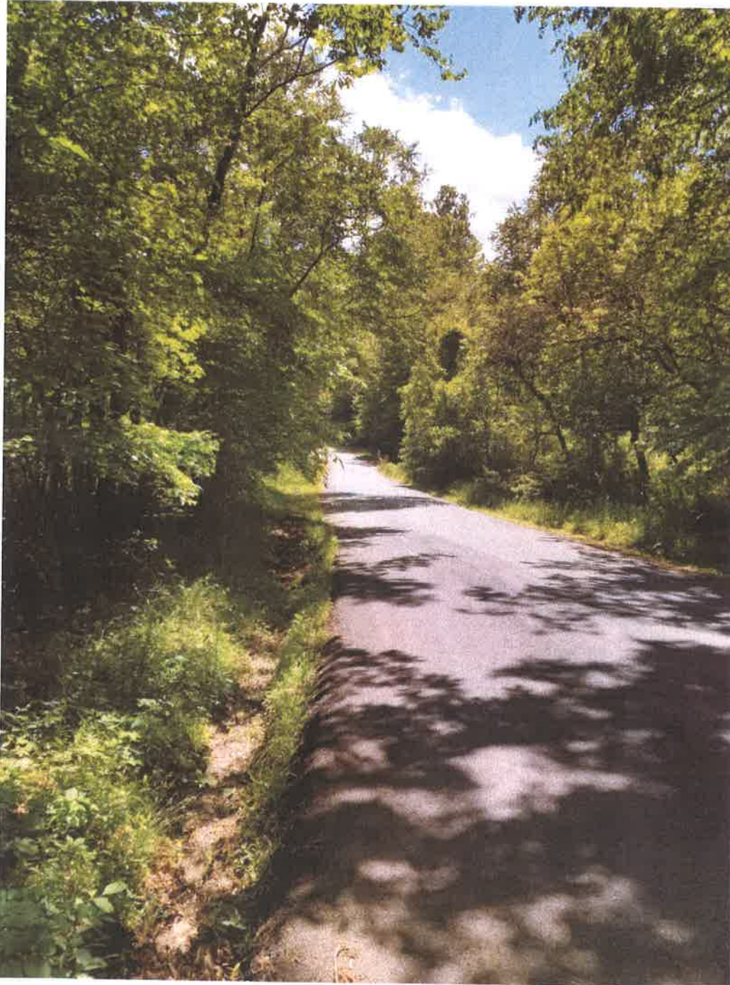
Parcel 003-Station 103+75 Facing South Proposed Right of Way, and Proposed Temporary Construction Easement