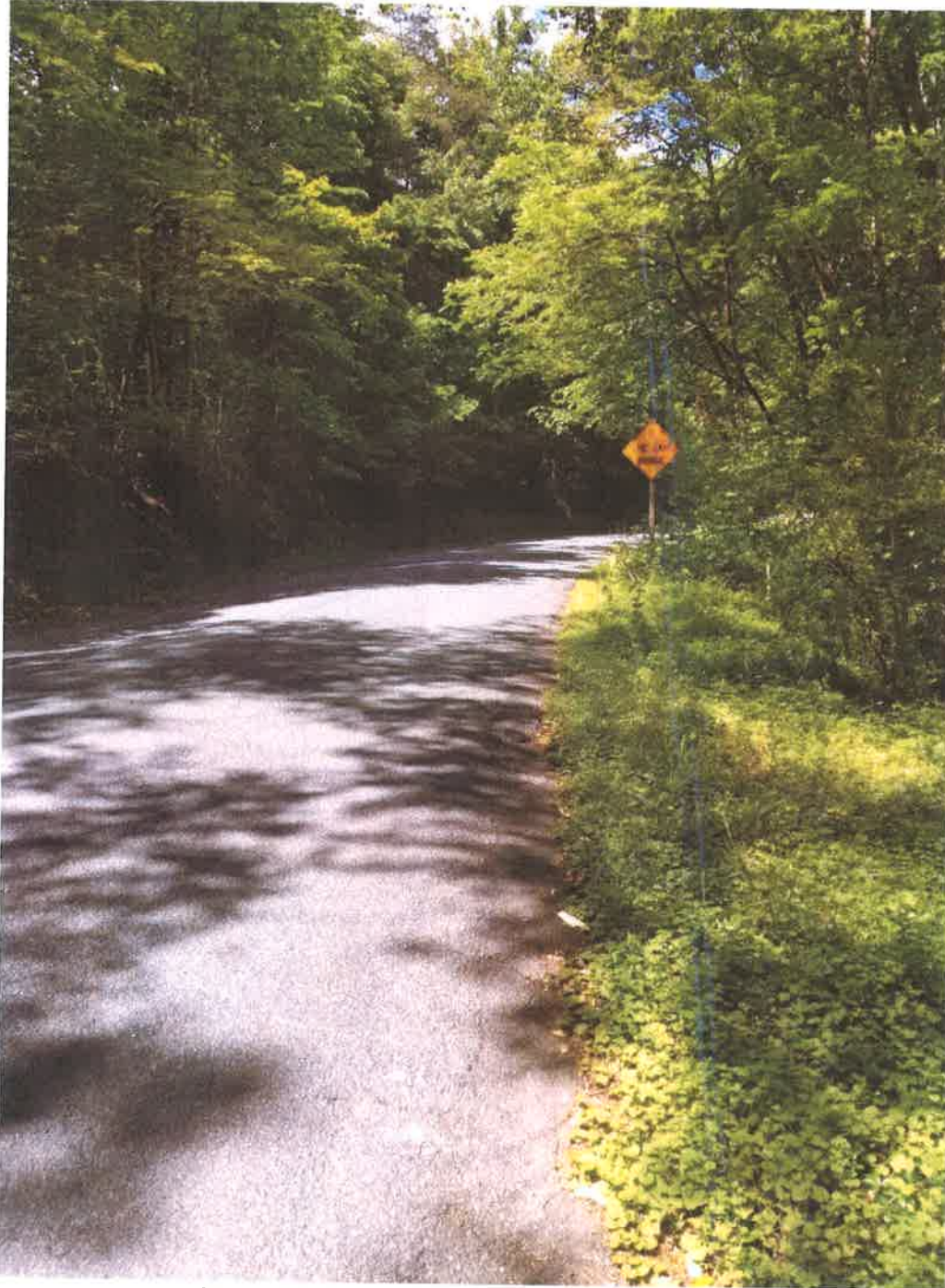
Parcel 003-Station 99+50 Facing North Proposed Right of Way, and Proposed Temporary Construction Easement