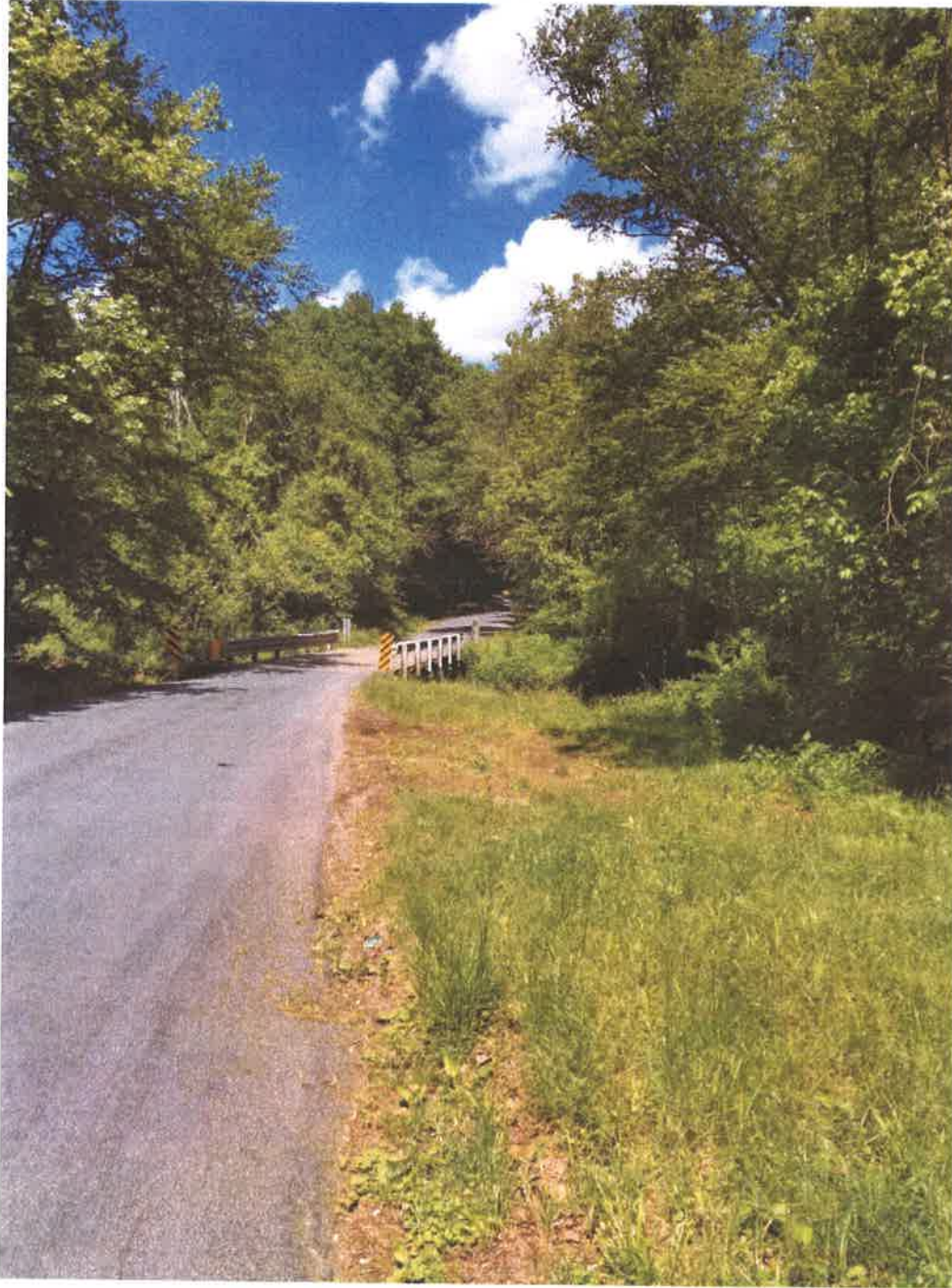
Parcel 003-Station 101+25 Facing North Proposed Right of Way, and Proposed Temporary Construction Easement