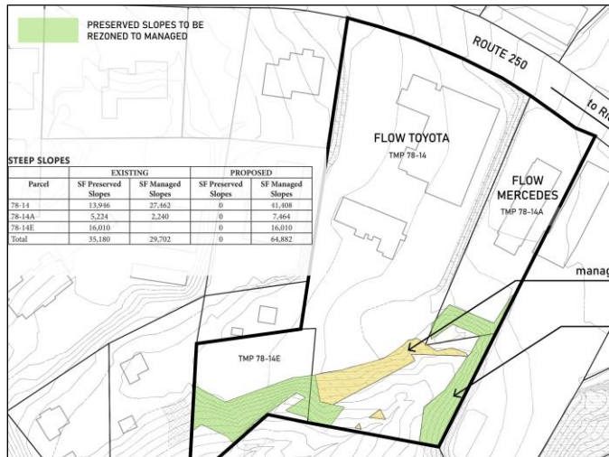
Figure 1: Concept dated October 22, 2024