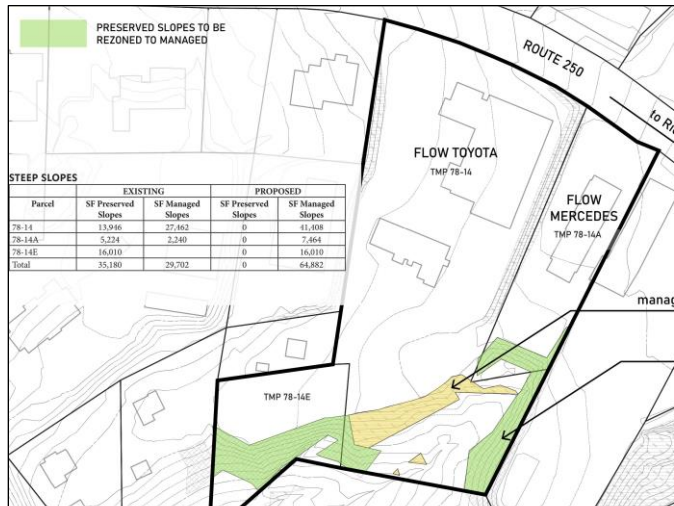
Figure 1: Concept dated October 22, 2024 2025