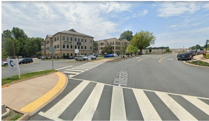
View of Building from Hillsdale Drive