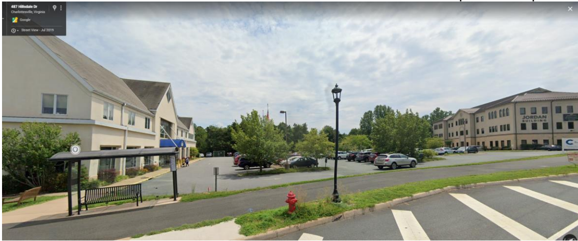
View of Existing VIA Building to the left, and Proposed Building for New School to the right