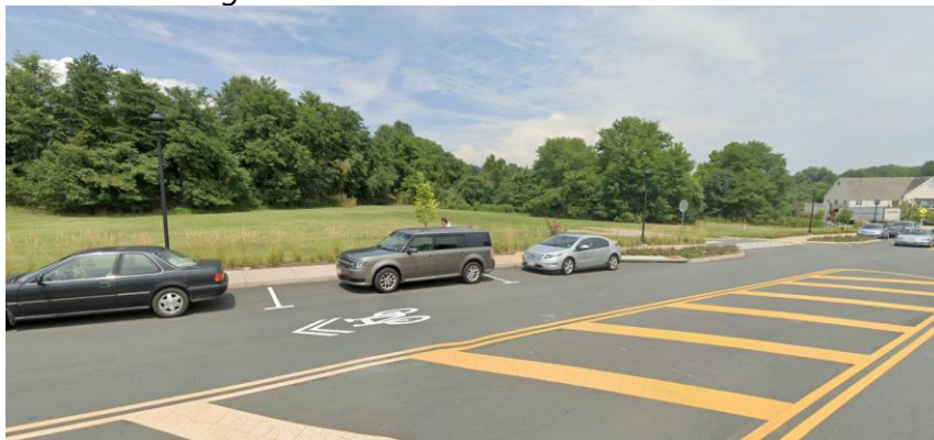
View of Vacant Parcel from Hillsdale Drive