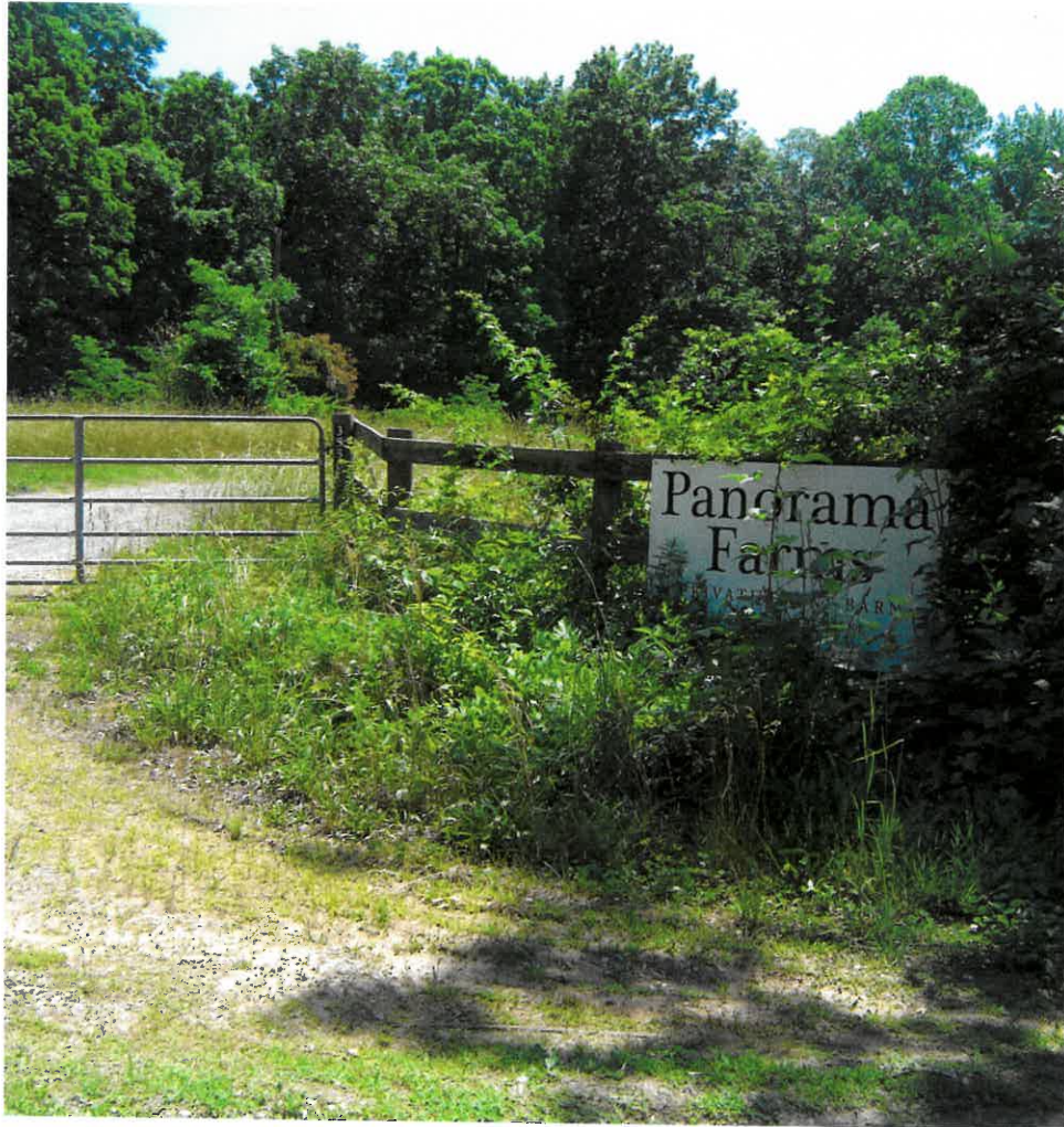
NORTHWEST ENTRANCE TO PANORAMA FARMS FROM REAS FORD LANE